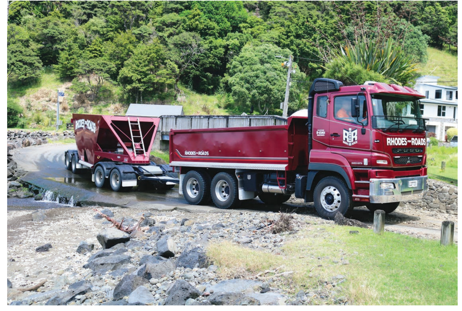
Warkworth based Rhodes for Roads provides a diverse range of civil contracting services, specialising in driveways and carparks right through to motorway work.

While retaining the family spirit, Rhodes for Roads has progressively grown as the local area has grown along with the demands from clients, some of whom are now into their second and third generation.